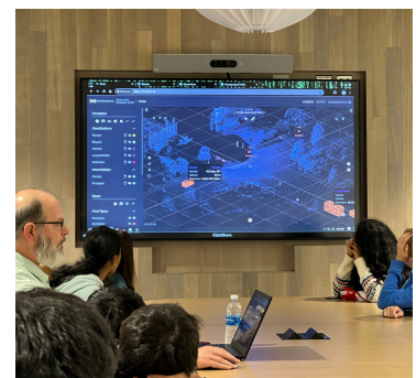
ET: Future Cities visits Cary Town Hall