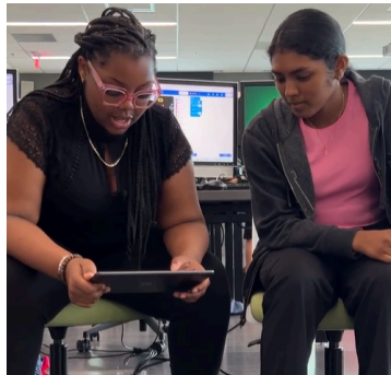
STEM Goes Red event at Durham Tech