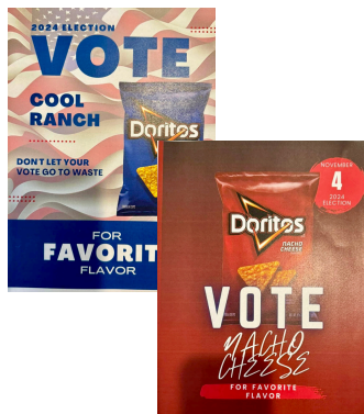
2024 Doritos Election winner: Nacho Cheese

We collected non-perishable items for our annual Food Drive. We also collected 15 turkey breasts to donate to families in need.